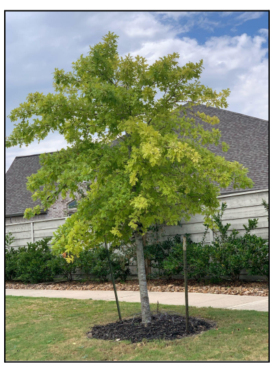
Yellow leaves are a sign your tree needs fertilization, presenting as a nutrient deficiency, making the leaves yellow instead of healthy green.

Fall Tree Planting: please reference last month's newsletter for more detailed information but PLEASE NOTE- If you lose a tree, replant the tree. The freezes in the previous two years have killed and severely damaged many trees. I know it is an expense to plant a tree, but replanting it is worth the money. If your tree was severely damaged and you had to cut the entire top of the tree out to remove dead wood, you should replace it.