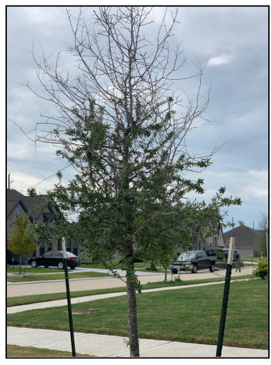
Example of dead wood that needs to be removed from this tree.

Prune & cut the dead wood out of your trees: Canopies of trees need to be lifted and lightened, and dead wood due to the freeze needs to be cut out. Oak trees can be pruned anytime until the end of February or starting again in July. Do not prune in March, April, May, or June to avoid spreading oak wilt disease. You can prune all other trees during the dormant season–light prune, removing crossover branches, sucker growth, and water sprouts. When making cuts, do not leave stubs. Never cut trees back from the top. When cutting back side branches, always cut even to another branch. Always remove dead wood and broken branches whenever you see them.