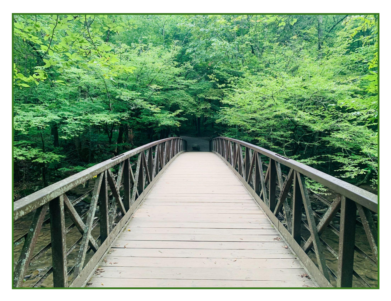
"Happiness is lying under a tree and looking at the sky through the leaves." (author unknown)