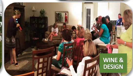
WINE & DESIGN