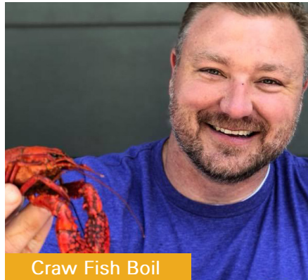
Craw Fish Boil