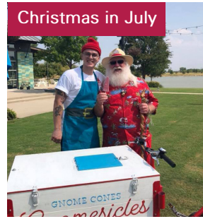
Christmas in July