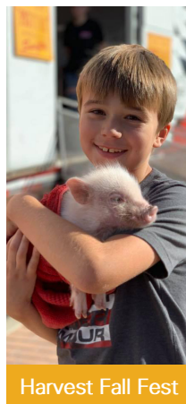
Harvest Fall Fest