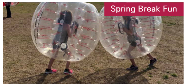
Spring Break Fun