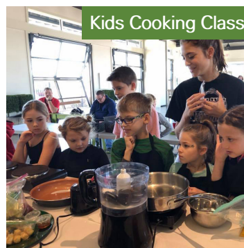
Kids Cooking Class