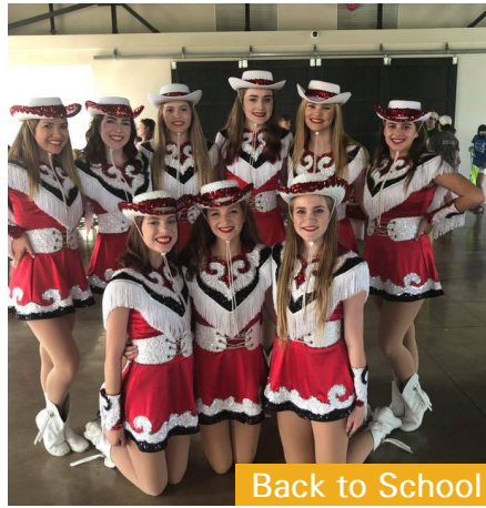
Back to School